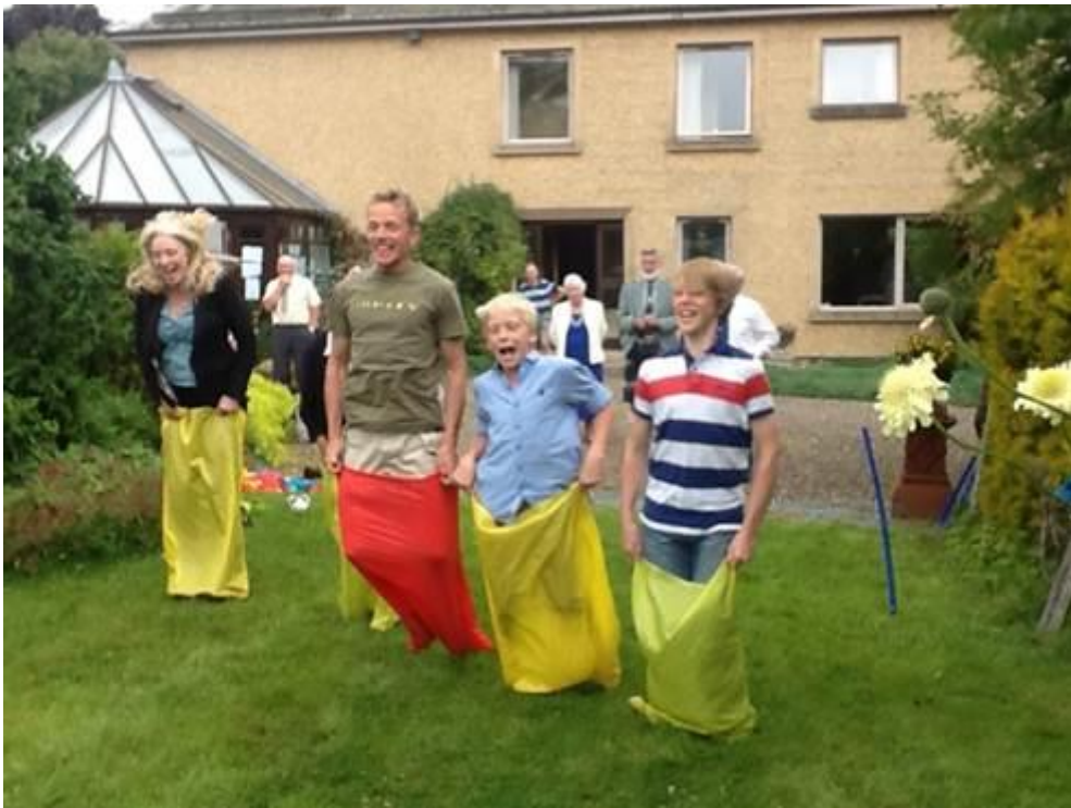
The Rodwell Family sack race!!