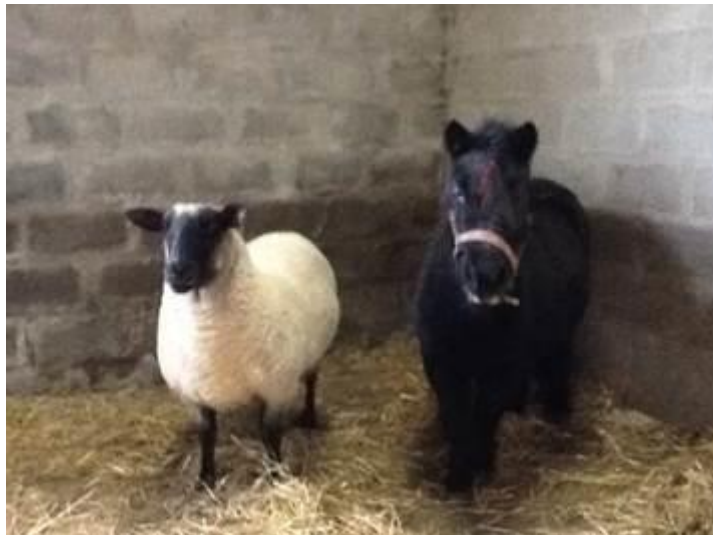
Waiting, waiting for Christmas Eve