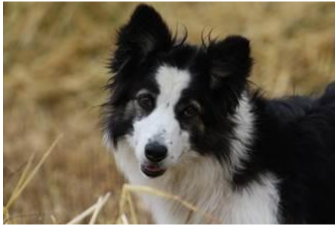
Who could say no to those eyes???