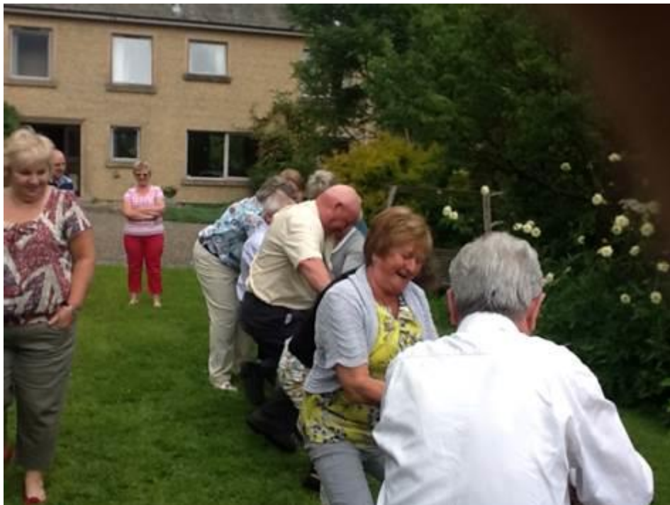
Fun and games at Langlee Park