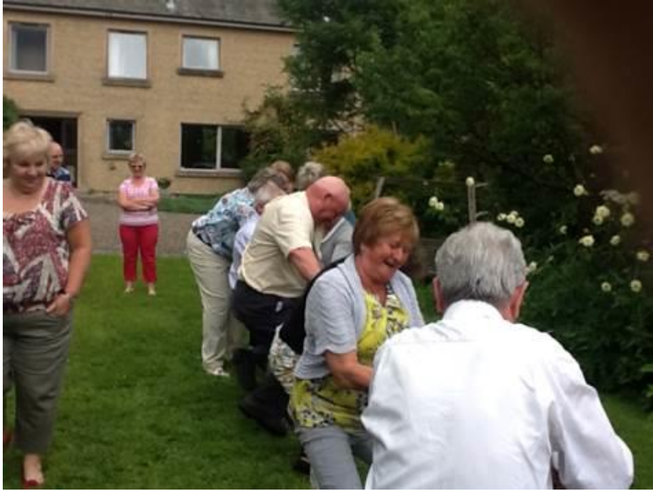
Fun and games at Langlee Park