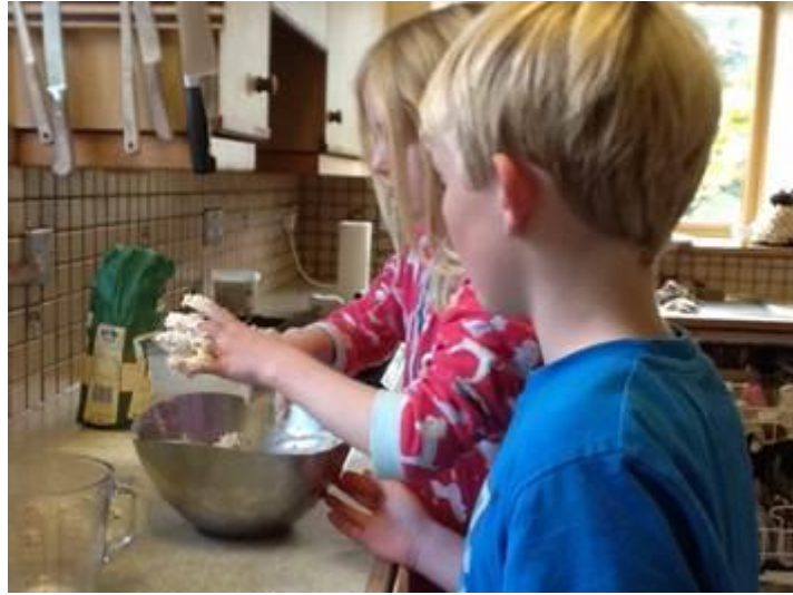
Lady elder called Francis needed here